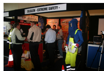
Key Industry Exhibitors