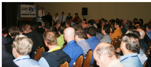
Real case studies to inspire and inform

Arrival and tea/coffee 8:15 am Starts at: 9:00 am Finishes at: 4:30 pm