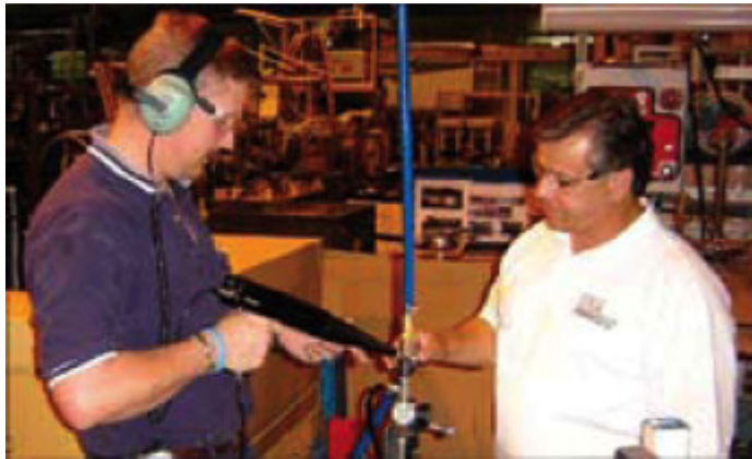
Figure 1- Know how to use your airborne ultrasound instrument.

* - Call for a vibration consult, review oil analysis and IR reports, if applicable