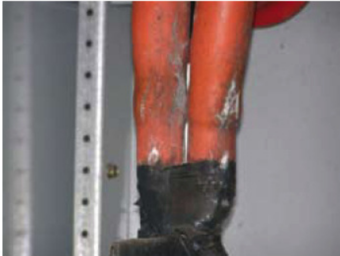
Figure 6 - White powdery residue is evidence of corona activity. This was detected using the airborne ultrasound receiver.

The by-products of corona are nitric acid, ozone, ultraviolet light, and carbon. So, can you imagine a 4160v switchgear cabinet that has a fault inside? The technician can hear corona along the door seams of the cabinet. While listening, perhaps he will remember a picture from a corona camera that he had seen in a recent Uptime Magazine article, which asked him to really try to visualize what is going on inside the cabinet.