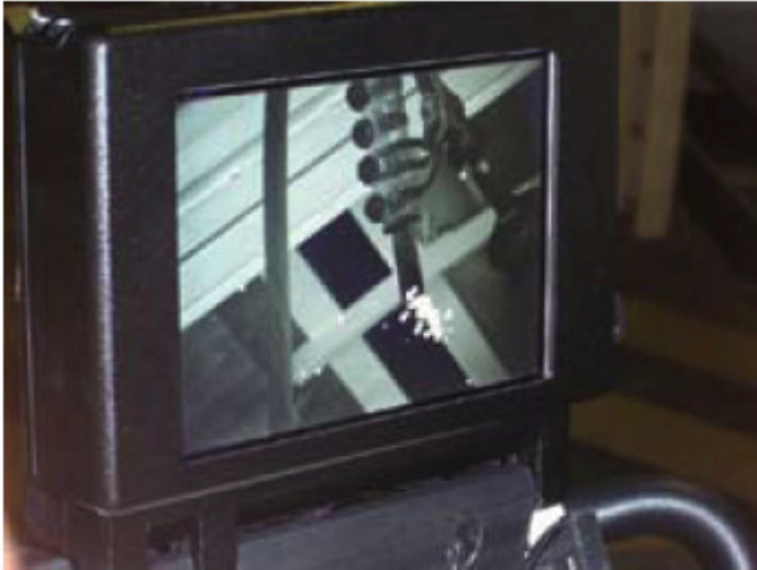
Figure 7 - A terminal end taken with a Corona Camera.

Did you know that ozone generators are used to break down the rubber on tires when the manufacturer wants to simulate wear and tear on the tires? Ozone actually breaks down the rubber. So that white powdery residue you sometimes see between two cables (Figure 6) is visual evidence of corona activity.