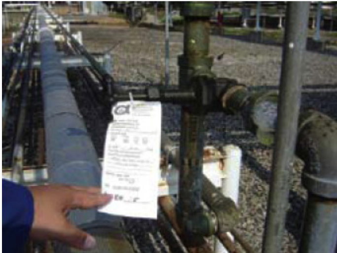
Figure 4 - Tag your leaks and photograph for referencing location and identification.

Air leak audits are popular because they are easily understood as an effective way to save money on utilities. However, it may surprise you to know that even when the leaks are identified, the majority are not repaired. It sounds bizarre, but facility after facility that I visit will have leaks identified, but not fixed. This happens because it's easy for programs to lose momentum somewhere along the way, or to get pushed further down on the list of priorities.